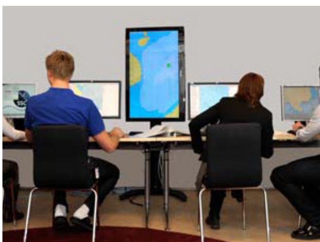
Images, video and situation overview is transmitted in real time to the Mission Command Center.