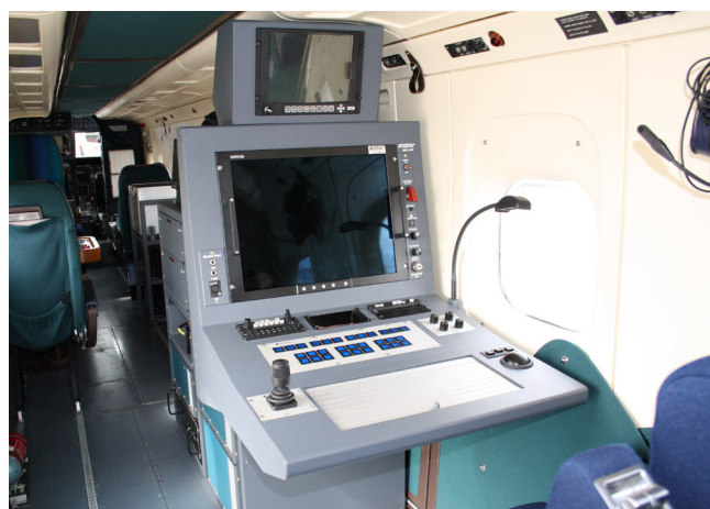
Each of the two MSS 6000 work stations gives the operator full control of the system including all sensors and communication assets.